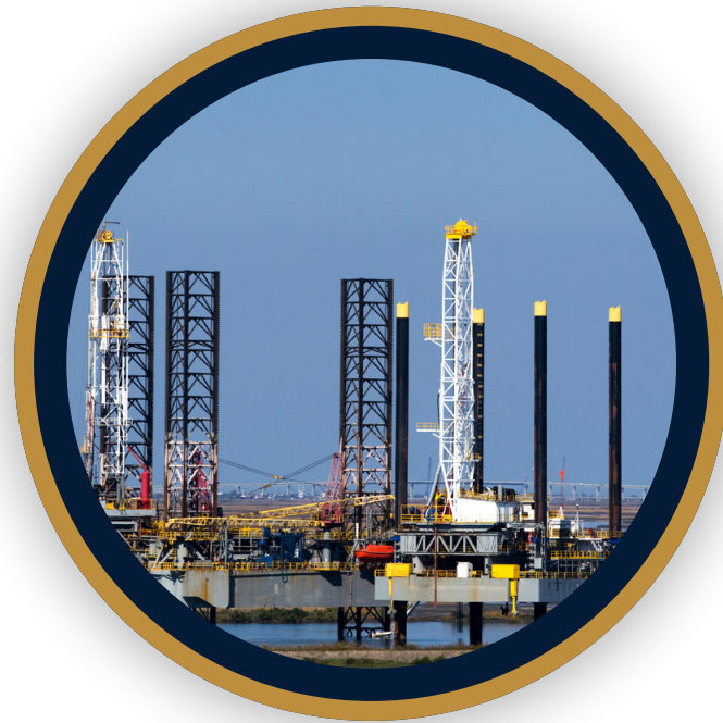
Oil & Gas Onshore