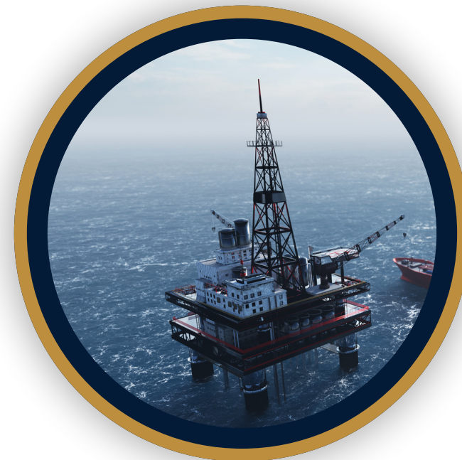
Oil & Gas Onshore